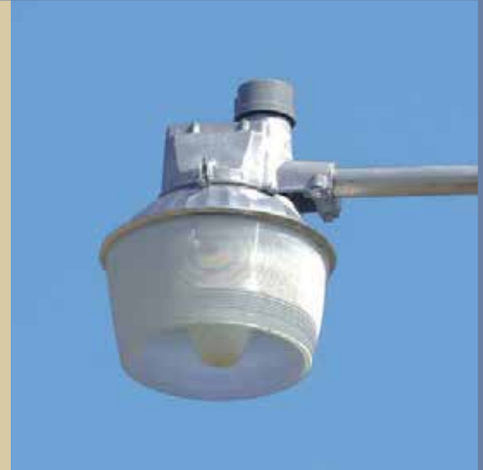
Semi-Enclosed (Open Bottom)

Poles Wood Fiberglass Metal (special conditions)