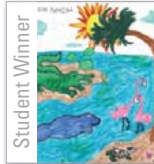
Ally, 10, Lake Mary

Support solar energy and get your free tote. Sign up today.