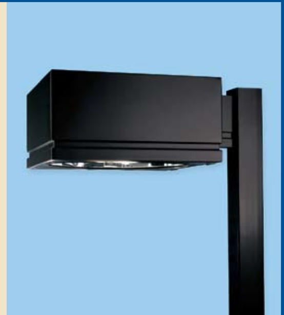
Cube (Special Order)

Note: These fixtures and poles are not stocked by Progress Energy. They must be special ordered and require up to eight weeks lead time for arrival.